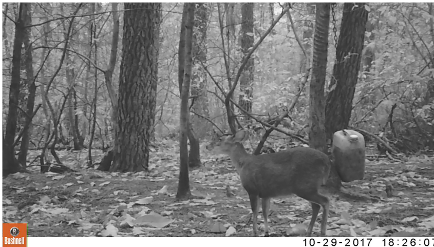
Figure 3: Detection of a female Reeves' muntjac by camera trap.

private enclosure in the Bois d'Aiguevives (City of Céré-la-Ronde, department of Indre-et-Loire: Hurel et al. 2019). From 2008 to December 2022, a cumulated number of 84 Reeves' muntjacs records were compiled (Figure 2): 69 were alive records, and 15 deaths. Overall, the number of records of Reeves' muntjacs in the wild remained at a low level between 2008 and 2016 across the metropolitan French territory, rising between 2017 and 2020, then decreased until 2023.